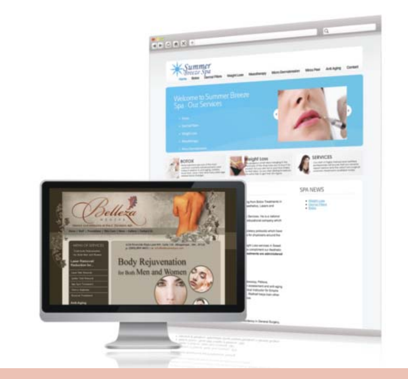
2720 East Oakland Park Blvd, Suite 102. Fort Lauderdale, Florida 33306

Rx Medical Web has developed over 400 medical, aesthetics, and dental practices over the past 12 years. Part of our success is due to our knowledge of medical marketing and the dynamics of a medical practice. We are a physician owned company with over 12 years experience in marketing for physicians and dentists. In addition to an impressive, full time design and internet staff in office (we do not outsource), we are a staff of physicians, business, and marketing personnel.